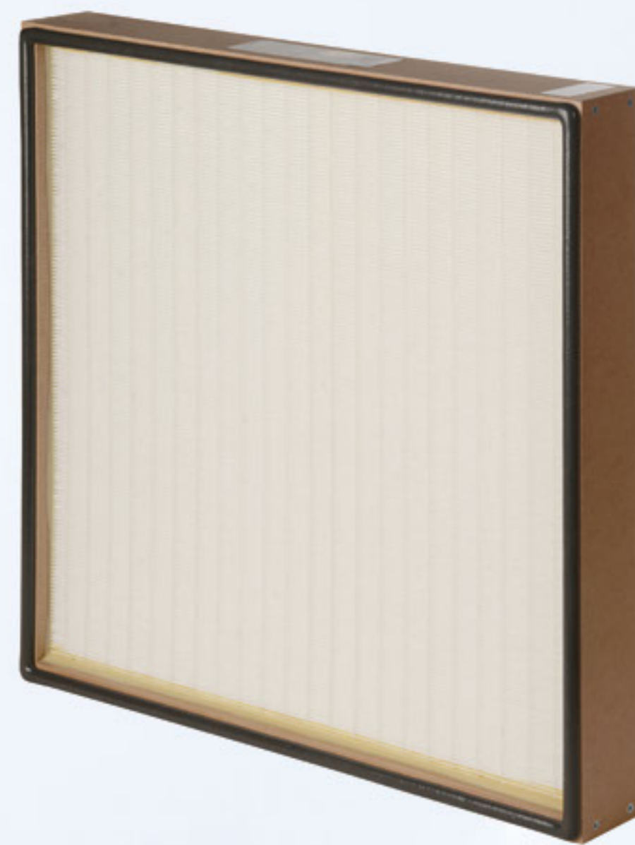
FP - Panel Filter