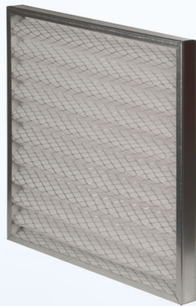
GZ - Z-Line Filter