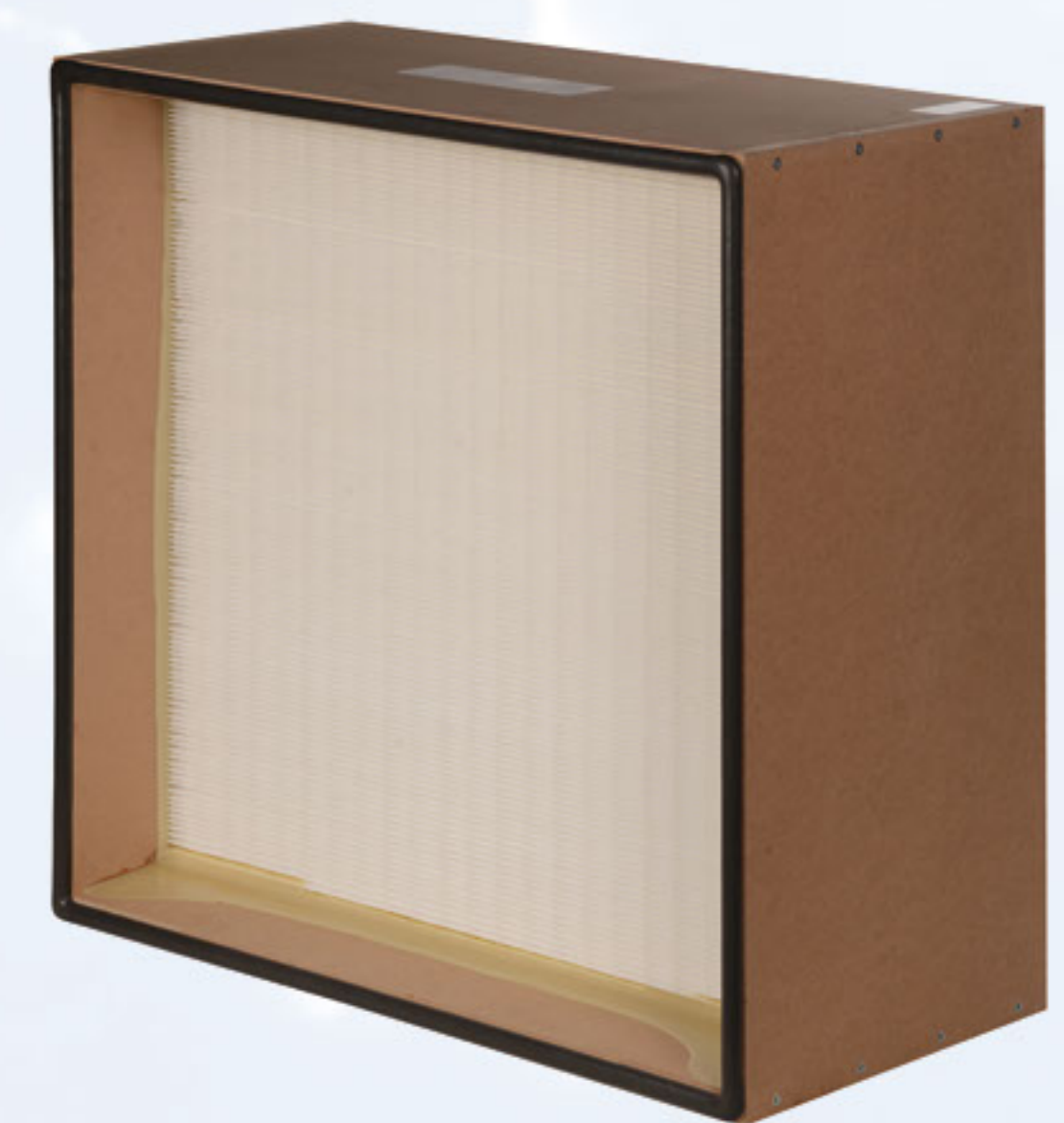
FHS - High Capacity Single Pleat Filter