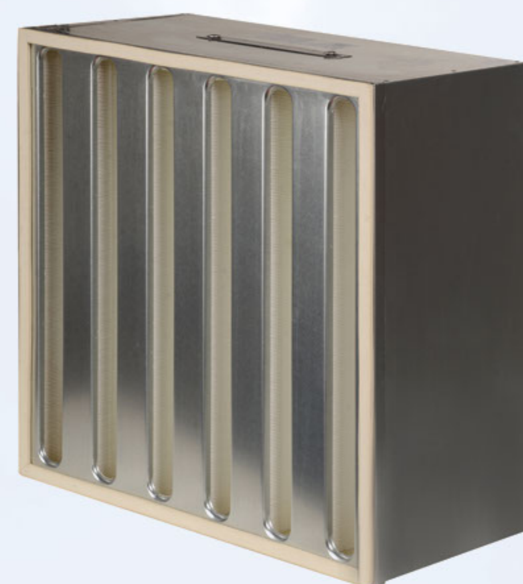
HHV - High Capacity HEPA V-Modul Filter