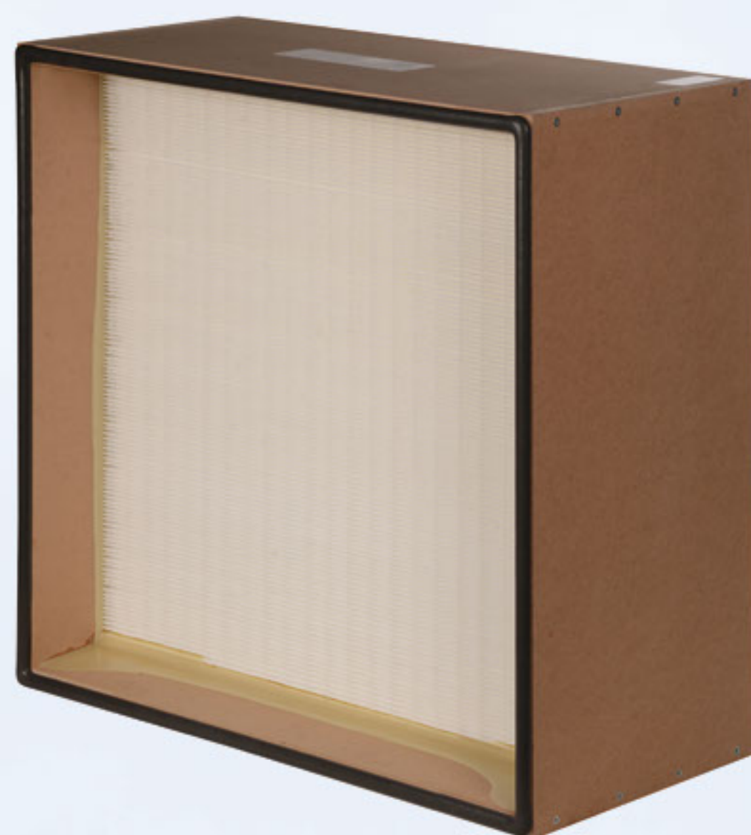
HHS - High Capacity HEPA Single Pleat Filter