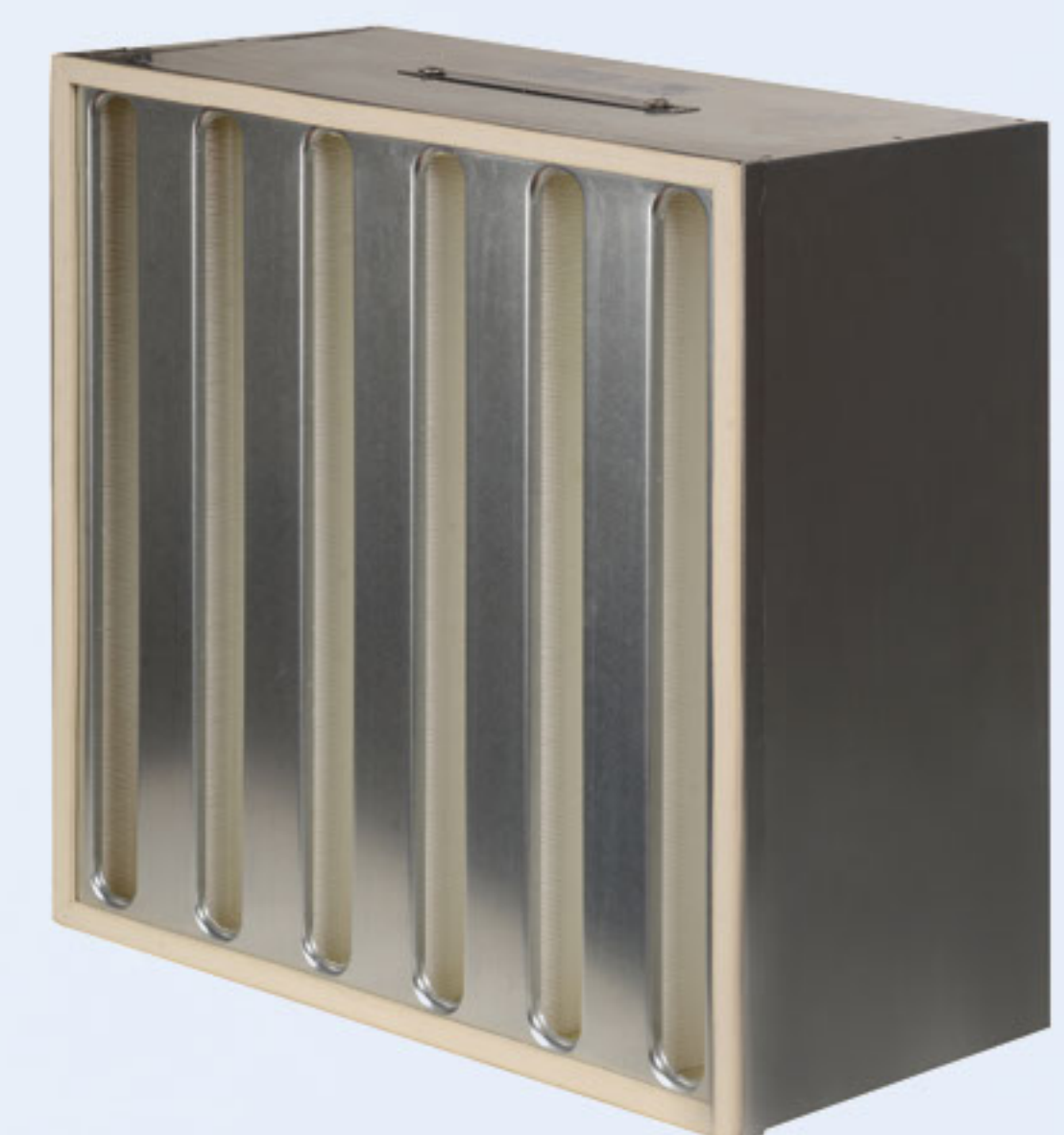
NF - Nuclear Filter